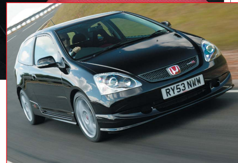
Facelifted 2004 Type R got more power.

uprated anti-roll bars, 15mm lower ride height and 17-inch alloy wheels with 205/45 R17 tyres.