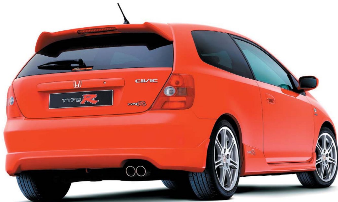
New Civic Type R of 2001 was built in Britain.