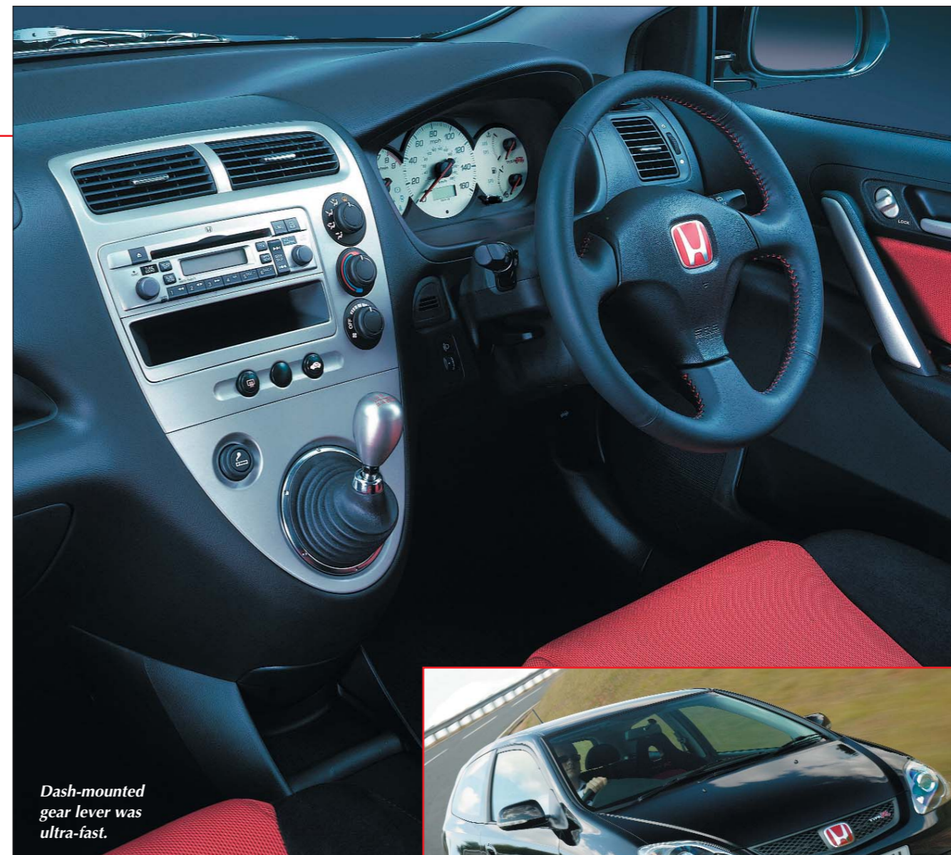
Dash-mounted gear lever was ultra-fast.

The Type R shell (three-door only) was stiffened up and the suspension got firmer dampers and springs,